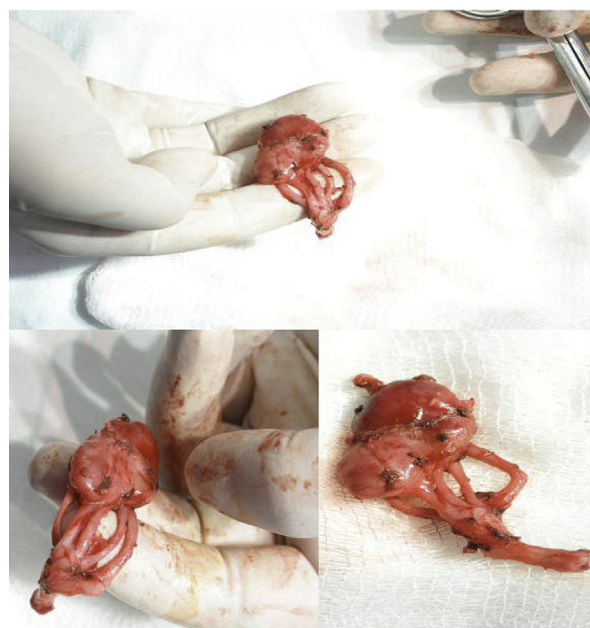
Figure 3. The surgical specimen – the left kidney with 5 ureters and 5 renal pelvises. (Color version available online.)