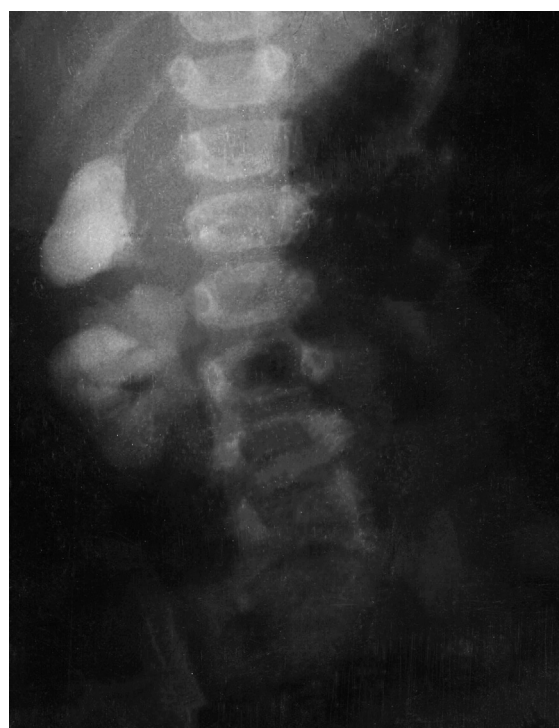
Figure 2. Urography – hydronephrosis of duplex right kidney. Nonexcretion of the left kidney.