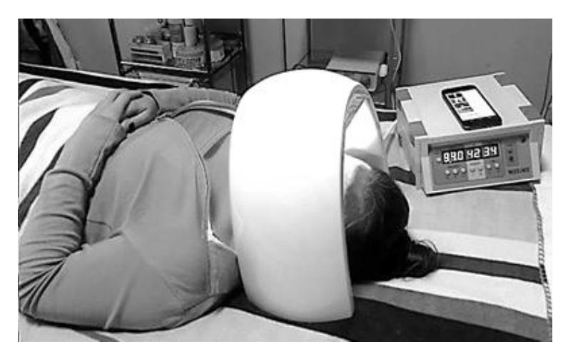
Fig. 1. Variant of the transcranial neuroacoustic and light-pulse stimulation procedure using the TARA apparatus.

The power of intravenous irradiation of blood flowing through the ulnar vein was 15 mW, the power of the light pulse flow was 270 mW. A variant of the procedure is shown in the figure Fig. 1.