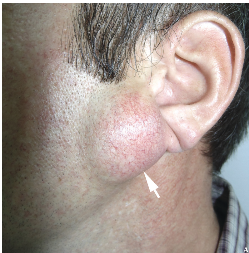
FIGURE 2. Case 2. Left lateral view (A) of a 42-year-old male with parotid gland tumor mimicker (arrow). Gray scale (ie, B-mode) US (B) shows round shape hypoechoic lesions with heterogenic content (asterisk) and smooth borders (arrowheads) neighboring with outer surface of parotid fascia. Lesion's avascular structure presented on the color Doppler US (C). Image D shows a specimen, cystic wall (arrow) and cheesy-smelled content (arrowheads) of which are typical for the atheromas 4 (ie, acquired epidermoid cysts which are also term as punctum-associated cysts) 5 . Cyst was removed with punctum in a part of skin (curved arrow). Images A and D printed with permission and copyrights retained by I.I.F. Images B and C printed with permission and copyrights retained by retained by O.S.C. (Fig 2 continued on next page.)