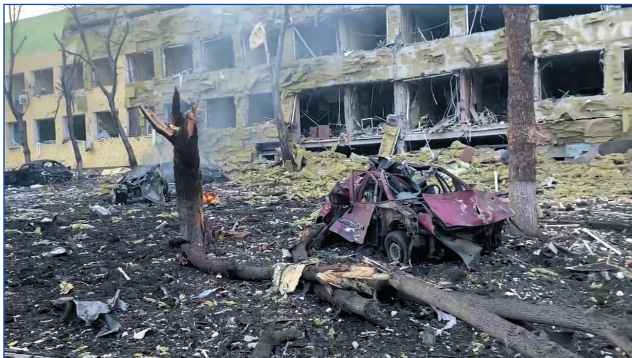
Figure 1. A children's hospital in Mariupol was destroyed as a result of a Russian airstrike ( www.pravda.com.ua/news/2022.03.9.7329805 )

Eighty-six attacks on medical workers were recorded, resulting in the deaths of at least 106 medics, 33 of whom died on the job, and 52 injured [8]. It must be said that in the frontline regions, an extremely difficult situation has developed with regard to the provision with medical personnel, which, together with the above-mentioned factors, definitely affects the availability and quality of medical care for children and adults. At present, the situation in the frontline regions has definitely worsened due to the transfer of medical staff to other regions of Ukraine and their emigration. This